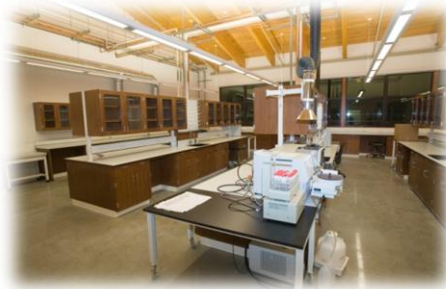
City's Water Quality Laboratory

The Water Resources Center is a functional, educational and visual extension of the water recycling plant it supports. The building, its systems, and its landscape have been designed to serve as an interpretive center that puts regional water issues on display to the regional community, educating the public through exhibitions and guided tours and promoting regional and community connectivity while providing a space for community interaction.