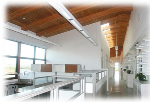
Operable windows, skylights

Exterior redwood siding was harvested from City-owned Grizzly Flats water shed located 8 miles from project site.