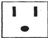
15 Amp Standard