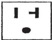
20 Amp Standard

Please indicate the number of Volts & Amps by selecting from the diagram below. List the number of appliances that will require electricity. All electrical equipment used MUST be UL approved.