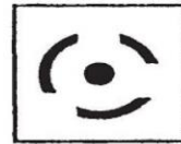
20 Amp 4 Pole Twist Center Ground